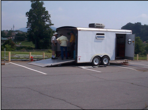
KN4ST's station is closely examined by KD4IMA, K7DXF and others.

June 27 th dawned with all indications the day would be hot. For those who gathered at the AB Tech Enka Campus for the annual event, hot would be the order of the day. Field Day (FD) for this year proved to be especially hot as participants set up their gear on the sun baked asphalt.